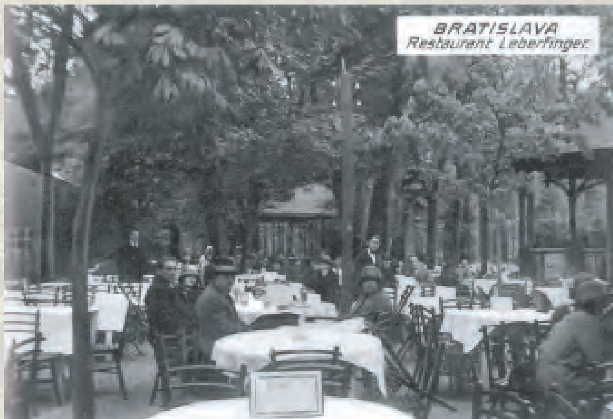
Historická fotografia – terasa Leberfingeru.